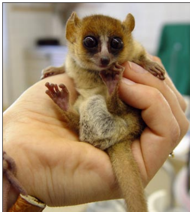
Figure 3. Microcebus lehilahytsara .

The exact distribution area for M. lehilahytsara has still to be assessed. Currently, it is known only from the type locality of Andasibe and surrounding regions (for example, Maromizaha Forest; Randrianambinina and Rasoloharijona 2006), including the two protected areas Analamazotra Special Reserve and Mantadia National Park (Kappeler et al. 2005; Mittermeier et al. 2006) (Fig. 1). The extent of the distribution of this species to the south and north is still unknown. Based on currently available information, it is unlikely that Goodman’s mouse lemurs occur in sympatry with other mouse lemur species. The maximum extent of its range to the south may be Ranomafana National Park, where it is replaced by M. rufus , and to the north to the Betampona Strict Nature Reserve and Zahamena Strict Nature Reserve