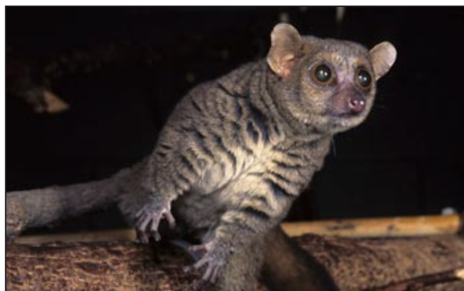
Figure 2. Mirza zaza.