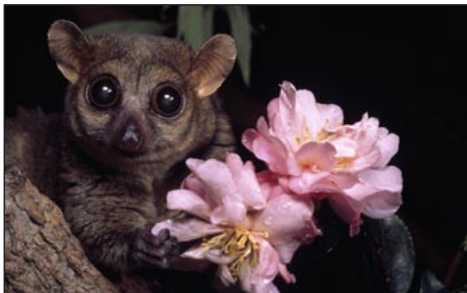
Figure 4. Mirza zaza . Photograph by R. Zingg

and National Park, where it is replaced by M. simmonsi (Kappeler et al. 2005; Louis et al. 2006).