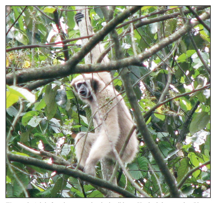
Figure 2. Adult female eastern hoolock gibbon, Hoolock leuconedys .

Chetry, D. 2009. Conservation of hoolock gibbon by integrating field surveys with education and awareness programme in Mehao Wildlife Sanctuary in Arunachal Pradesh, India. Final Report, Critical Ecosystem Partnership Fund (CEPF), Arlington, VA, and Ashoka