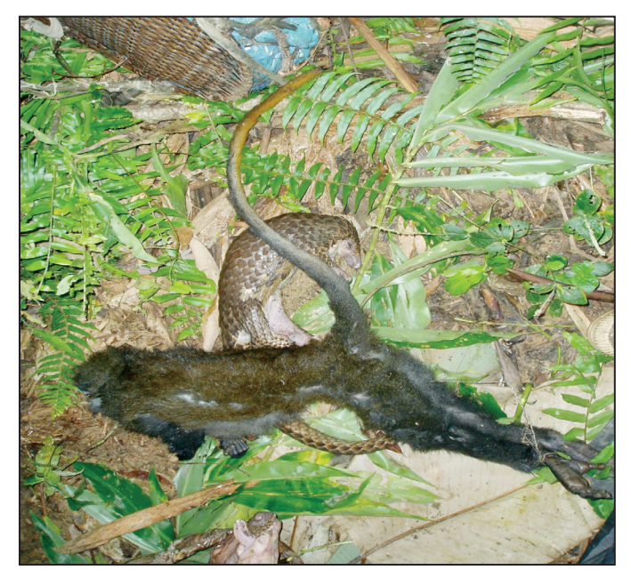
Figure 2. Adult female Cercopithecus solatus trapped near Mbégho on 7 June 2004. It shows the typical body coloration of the species: black legs, brownreddish back and flanks, tail distal part yellowish. It is shown here along with a common pangolin Manis tricuspis that was caught in the same locality by the same hunter.

Bushmeat inquiries were led by Jean-Jacques Tanga in several villages along the roads from Baposso to Mbigou (01°53'47"S, 11°54'37"E, altitude 700 m; Boumi-Louétsi Department, Ngounié Province), Mbigou to Koulamoutou (Lolo-Bouenguidi Department, Ogooué-Lolo Province), and from Koulamoutou to Pana (Lombo-Bouenguidi Department, Ogooué-Lolo Province), i.e., the three roads respectively situated near the eastern, northern and western limits of Mount Birougou National Park (February–March 2004, July 2004, June 2005). Main localities and park delimitations are shown