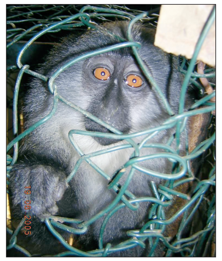
Figure 3. Young female Cercopithecus solatus captured in the buffer zone of Mount Birougou National Park, southern Gabon, in June 2005.

villagers brought him a juvenile female in early June 2005 (Fig. 3). It had been caught in a ground snare in the northeastern buffer area of Mount Birougou National Park, in a hilly area (altitude 600 m). In the early afternoon of 8 March 2004, Tanga observed a single adult resting on a tree branch at the forest edge along the road between Popa and Mbigou Moréné (01°31'12"S, 12°17'24"E; altitude 355 m; Lolo-Bouenguidi Department, Ogooué-Lolo Province).