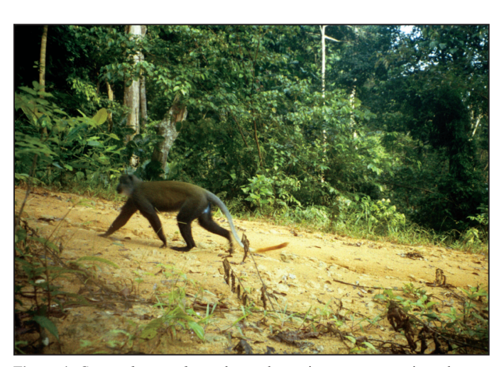
Figure 4. Cercopithecus solatus photo taken using camera trapping, close to Mount Mimongo.

Fifteen camera traps were deployed in a 30-km<sup>2</sup> study area over 54 days between 28 August and 21 October 2004 in an area about 10 km to the south of the southern bank of the Lolo River. No images of C. solatus were obtained. This indicates that the species is either absent or very rare south of the Lolo River. Lauren Coad and local field assistants conducted a hunting study from January 2004 to January 2005 in the same area in two villages, Dibouka (01°19'07"S, 12°12'54"E) and Kouagna (01°18'28"S, 12°13'45"E). Their results showed considerable hunting pressure that was highest within 5 km from the villages, but also extended up to hunting camps 12 km to the north, on the southern bank of the Lolo. During this study all hunting returns for the two villages were recorded, and no C. solatus were ever caught or seen. During a previous hunting study in these villages conducted by Malcolm Starkey from 2000 to 2002, no C. solatus were