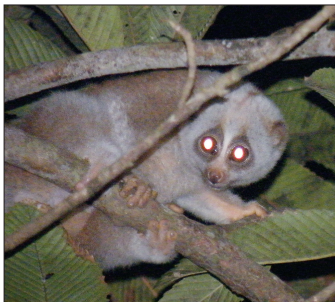
Figure 1. Bengal slow loris, Nycticebus bengalensis , in the state of Meghalaya, northeast India.

We obtained information on the presence of Bengal slow loris ( Nycticebus bengalensis ) through field surveys and secondary sources of information. Night transects were conducted along established human and animal trails, roads, streams, and rivers. In the case of paved roads passing through the forest, we used four-wheel-drive vehicles driven slowly (<5 km/hr), most especially in areas with high numbers of rogue elephant incidents. Once, we used a boat to survey forests along the river, as it provided the best access in that terrain.