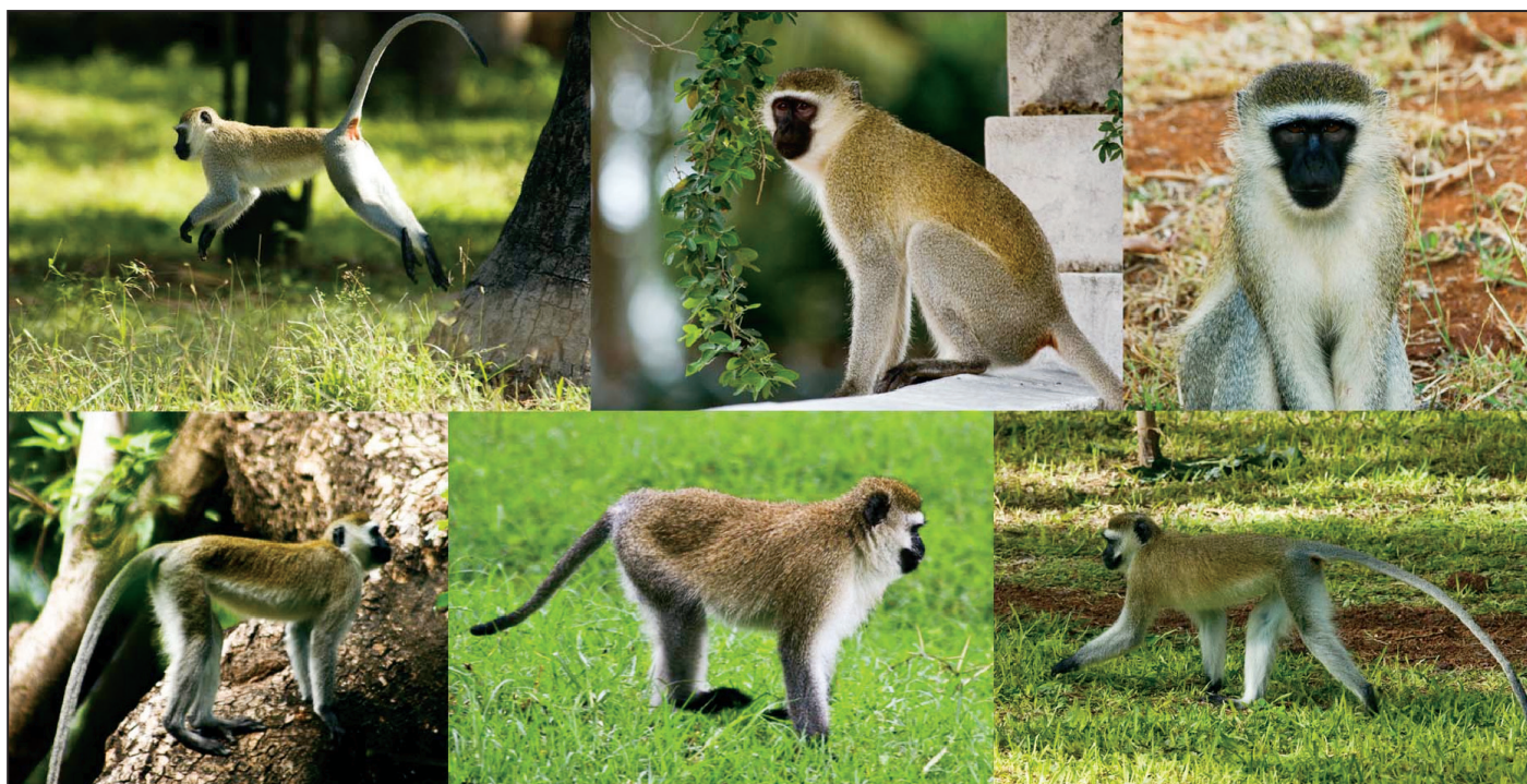
Figure 4. Chlorocebus pygerythrus ‘ hilgerti ’ adult males over the geographic range in Kenya and Tanzania surveyed during this study. Top row , left to right: Malindi, northern coast of Kenya; Majengo, north of Mombasa, southern coast of Kenya; Tanga, northern coast of Tanzania. Bottom row , left to right: South Horr, north-central Kenya; Lake Naivasha, south-central Kenya; Lake Manyara, north-central Tanzania.

We are grateful to Primate Conservation Inc., the Margot Marsh Biodiversity Foundation, the Primate Action Fund, and the Critical Ecosystem Partnership Fund at Conservation International for financial support. We acknowledge the Kenya Ministry of Education, Science & Technology (permit 13/001/33C 283) and the Tanzania Commission for Science