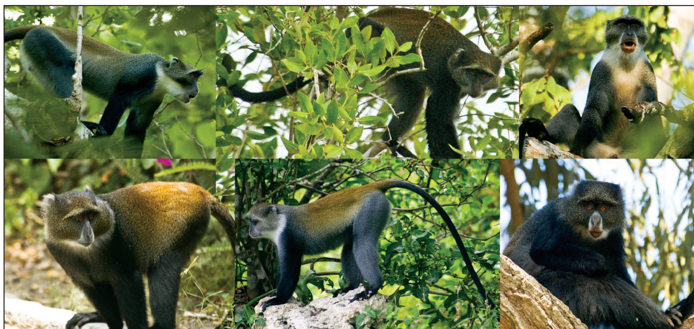
Figure 3. Cercopithecus mitis ‘ albogularis ’ adult/subadult males over the geographic range in Kenya and Tanzania surveyed during this study. Top row , left to right: Gedi Ruins, central coast of Kenya; Saadani National Park, northern coast of Tanzania; Mrima Hill, southern coast of Kenya. Bottom row , left to right: Usa River, northeastern Tanzania; Unguja Island, eastern Tanzania; Ndarakwai, northeastern Tanzania.

Some geographic variation among adult and subadult male C. p. ‘hilgerti’ is, however, present, particularly in (1) the intensity of pelage color, (2) the length of the whiskers,